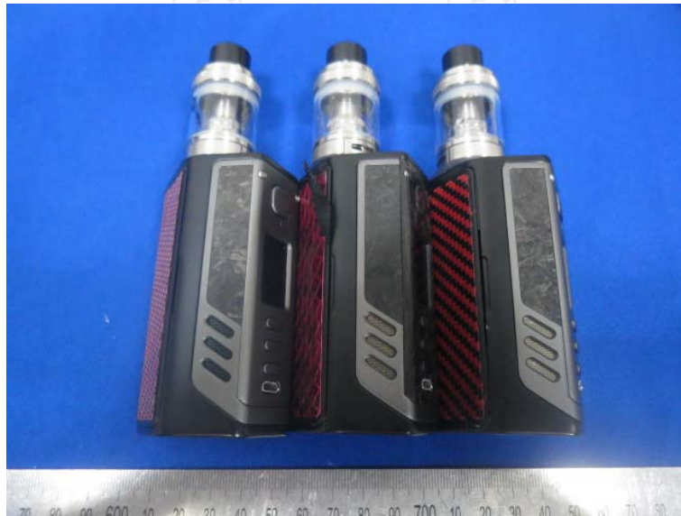
Triade DNA 250C Kit (Triade DNA 250C Mod + Lyra Tank)