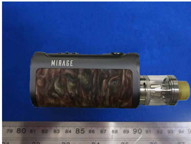
Mirage DNA 75C Kit (Mirage DNA 75C Mod + Sirius Tank)